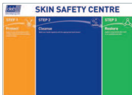
SSCBOARD1 Deb 3-Step Skin Protection Centre - Board

Use the 'board only' option, plus individual dispensers (ordered separately) to suit the following situations.