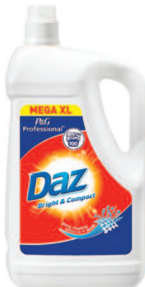
Daz Mega XL 100 Wash (5 Ltr) Code: DAZ LIQUID