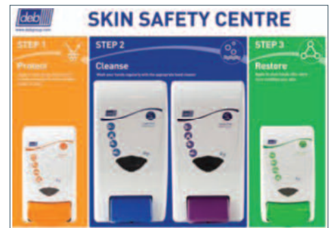
SSCLG42EN Deb 3-Step Skin Protection Centre - Large 4 Plus 4