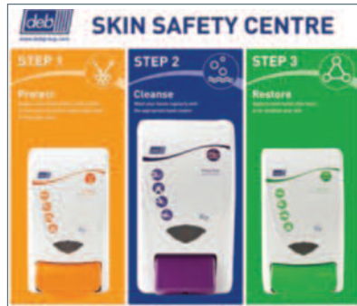
SSCSML1EN Deb 3-Step Skin Protection Centre - Small