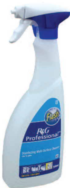
Flash Disinfecting Multi-Surface Cleaner (& Glass) 750ml Code: FMS01