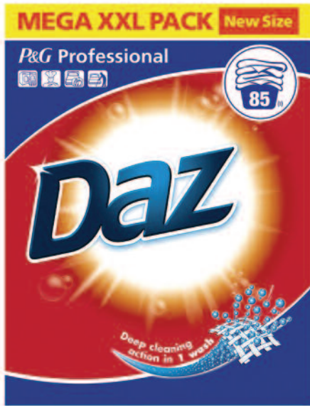
Daz Mega XXL Pack 85 Wash Code: DAZ POWDER