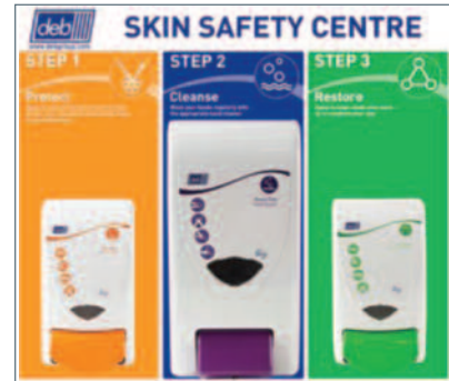
SSCSM42EN Deb 3-Step Skin Protection Centre - Small 4L