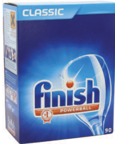
Finish Powerball Classic 90 wash Code: SUN003