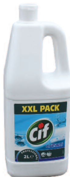
Cif Cream XXL Pack 100 Wash (2 Ltr) Code: CIF CREAM