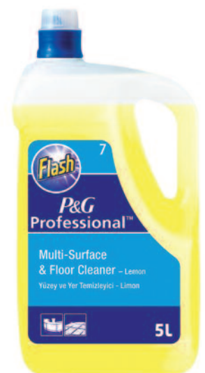
Flash Multi Surface & Floor Cleaner 5 Ltr Lemon Code: FMS01