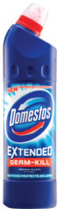
Domestos Bleach 750ml Code: DOM750

Non caustic foam cleaner for thorough cleaning of large, complex and inaccessible plant surfaces. Easily rinsed to a clean sparkling shine. Biodegradable and Phosphate free.