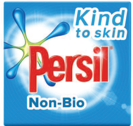
Persil Non-Bio Washing Powder 90 wash Code: 7522885