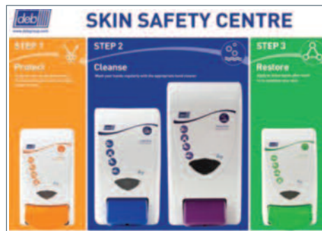
SSCLGE1EN Deb 3-Step Skin Protection Centre - Large